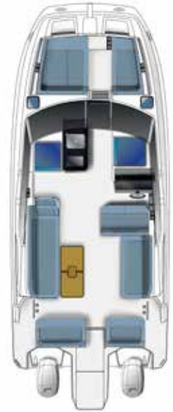
STANDARD MAIN DECK